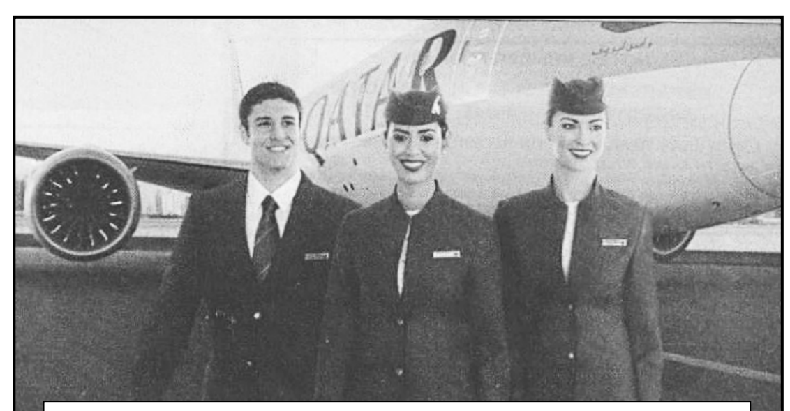
BE PART OF A STORY WORTH TELLING

Using the dialogue form, write the interview that takes place.