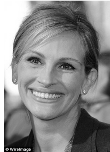
Too perfect: The Advertising Standards Agency banned this Lancome advert of actress Julia Roberts after complaints it was misleading