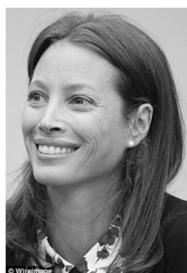
Too good to be true: This Maybelline advert starring Christy Turlington was one of the adverts banned over its use of the airbrush

L'Oreal admitted that certain 'post production' techniques had been used on the image of the actress but insisted the picture was an accurate representation of her 'naturally healthy and glowing skin'. L'Oreal was also in the dock over its image of Christy Turlington in a magazine ad for The Eraser foundation, from its Maybelline brand.