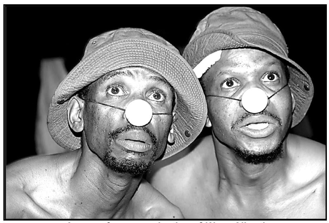
A scene from a production of Woza Albert!

You have been chosen to direct a school production of Woza Albert! at your school. Use SOURCE A to guide the planning and preparation of your play.