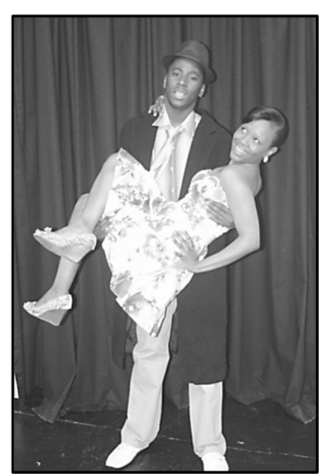
Mingus and Princess in a production of Sophiatown

You are the director of a school production of this play.