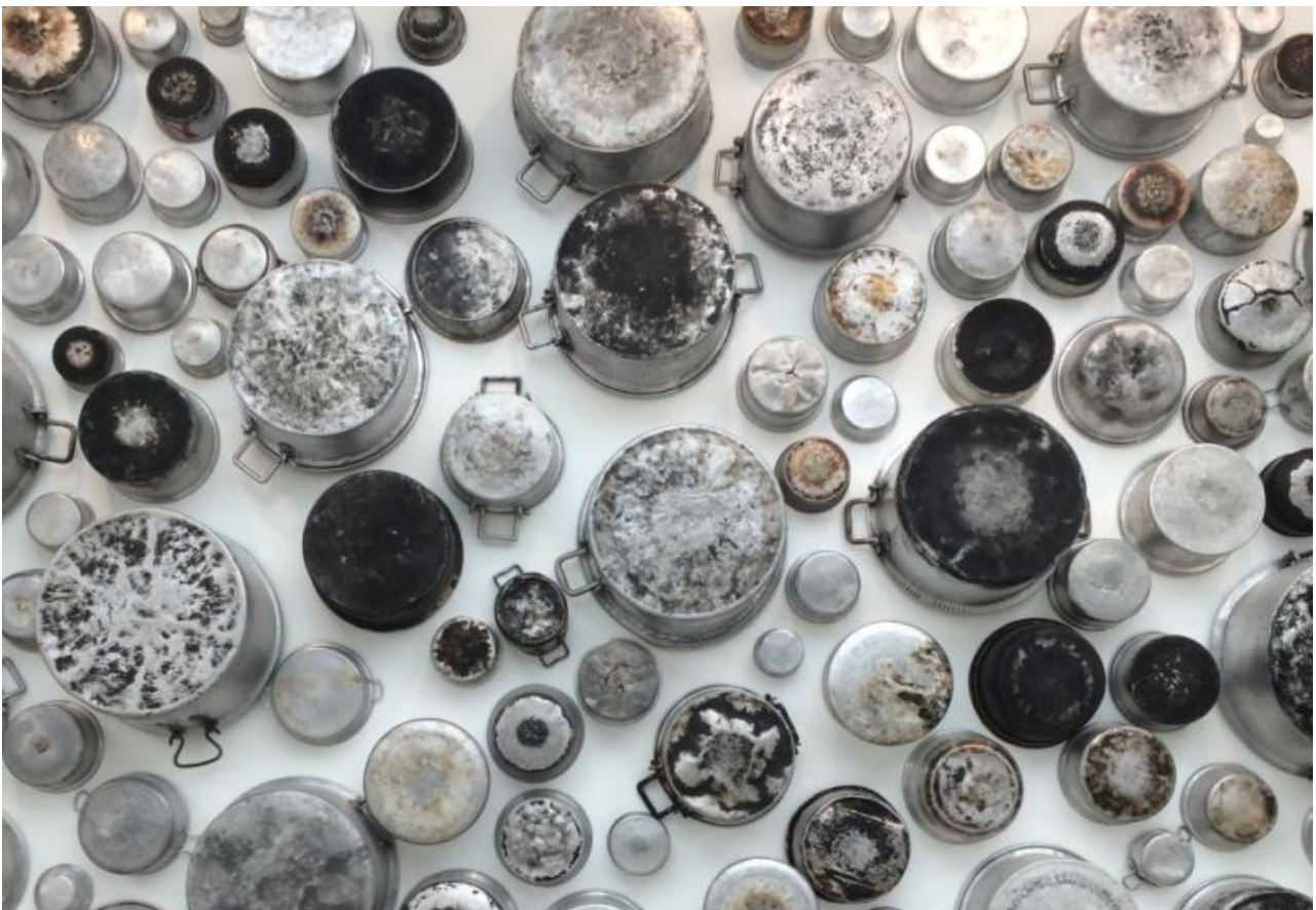
Detail view of burnt pots from Image B Food for Thought – Al-Mu'allaqāt