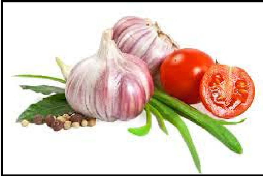
[Umfanekiso uthatyathwe kwi-intanethi]

Yenza iresipi yesidlo osithandayo. Landela ezi ngongoma: