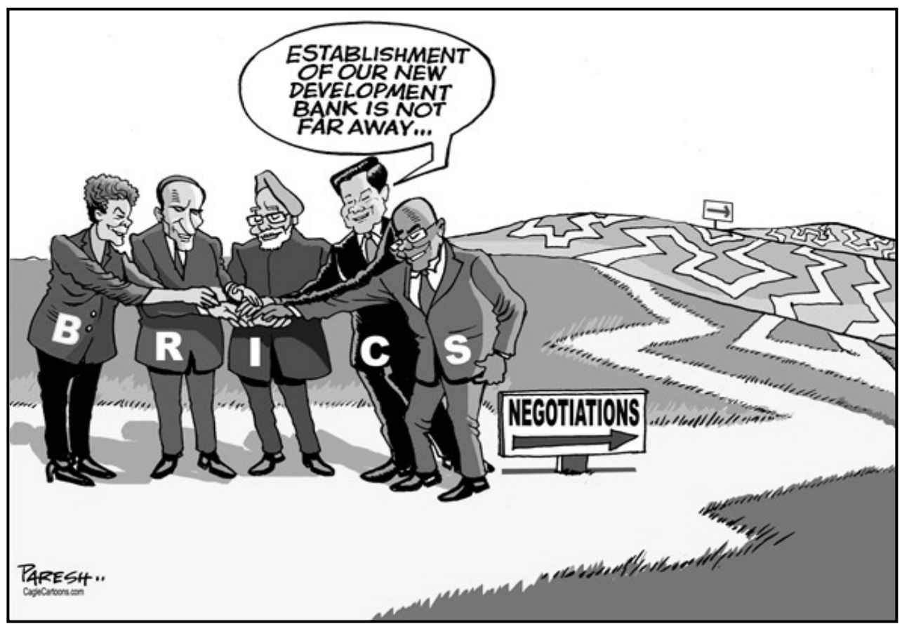
[From: www.cagle.com/2013/03/brics-development-bank. Accessed on 20 February 2015.]