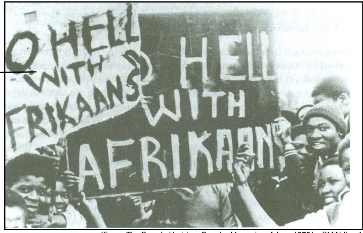
[From: The Soweto Uprising: Counter Memories of June 1976 by SM Ndlovu]

This photograph shows students from Soweto on 16 June 1976, protesting against the introduction of Afrikaans as a medium of instruction.