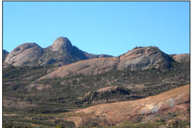
Photograph 6: Igneous Landform – Question 3.4