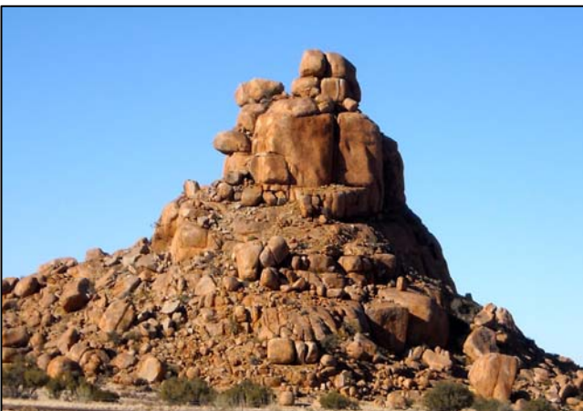
Photograph 7: Igneous Landform – Question 3.4