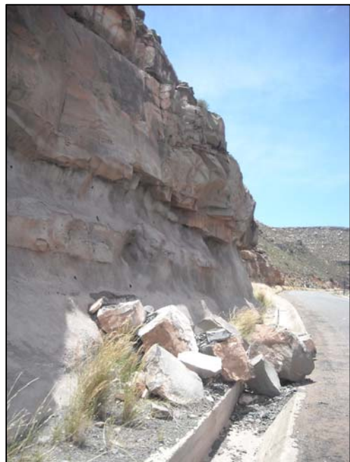
Photograph 8: Road near Sutherland in the Karoo – Question 3.4.4