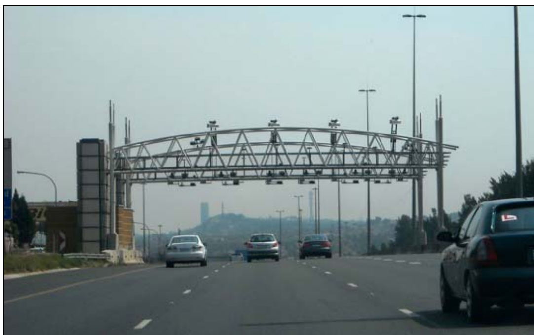
Photograph 1: An e-toll plaza on the freeway from ORT International Airport to Johannesburg – Question 1.5.5

[Adapted: Urban Green File, December 2012]