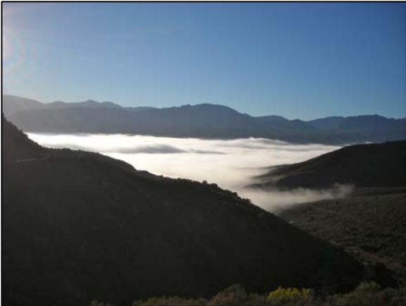
Photograph 5: Piketberg Pass, W Cape – Question 3.2