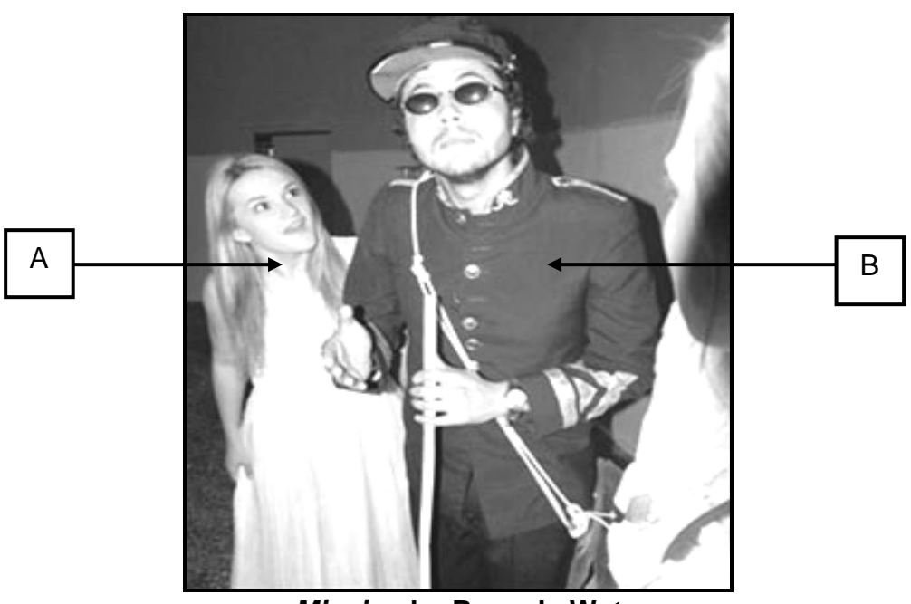
Missing by Reza de Wet