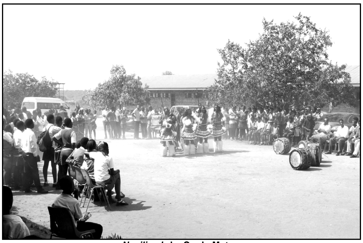
uNosilimela by Credo Mutwa