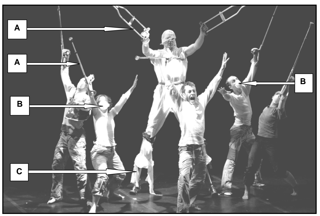
PUSH Physical Theatre