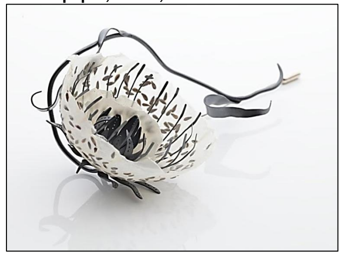
Image B: Sabrina Meyns, Brooch 2 handmade paper, seeds, silver and steel