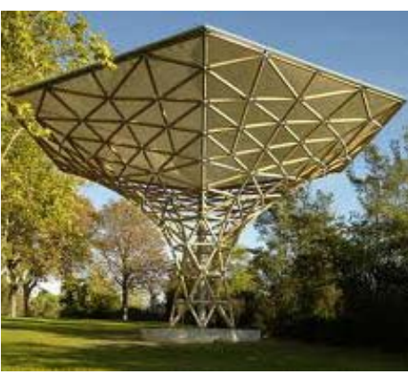
Shigeru Ban - Pavillion Cezanne in Provence festival, France - Cardboard rolls