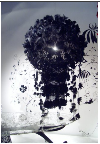
Tord Boontje - Come Rain, Come Shine chandelier - metal framework, ribbon and crochet