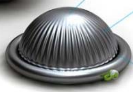
Kitae Pak - Dew Bank Bottle -Stainless steel body, plastic cap