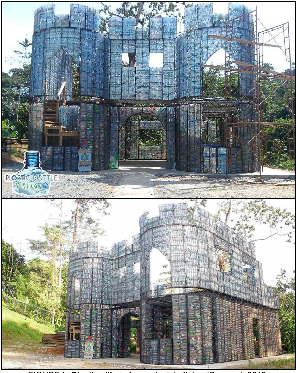
FIGURE L: Plastic village house by Isla Colon (Panama), 2016.

Effective sustainable design solutions comply with the principles of social, economic and ecological sustainability.