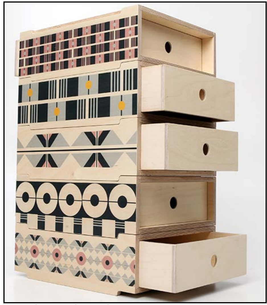
FIGURE A: Chest of drawers by Renée Rossouw and Deánne Viljoen, De Steyl Studio (South Africa), 2015.