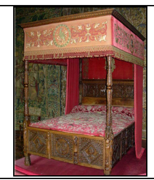
FIGURE H: Renaissance bed.