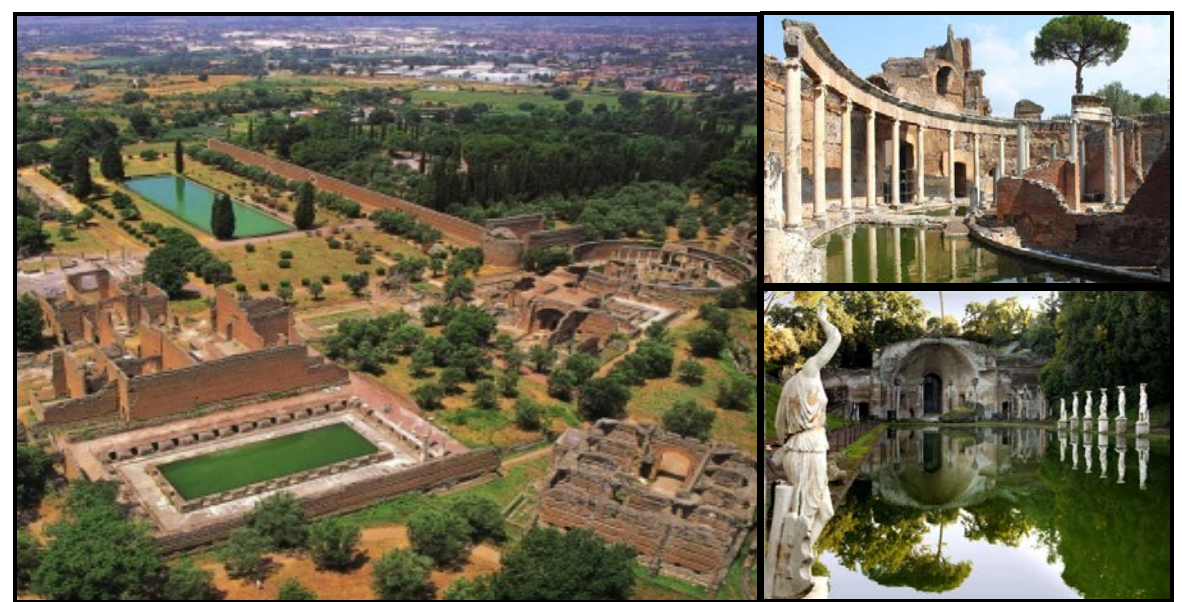
FIGURE F: Hadrian's Villa , architect unknown (Tivoli, Italy), 2<sup>nd</sup> century BCE.