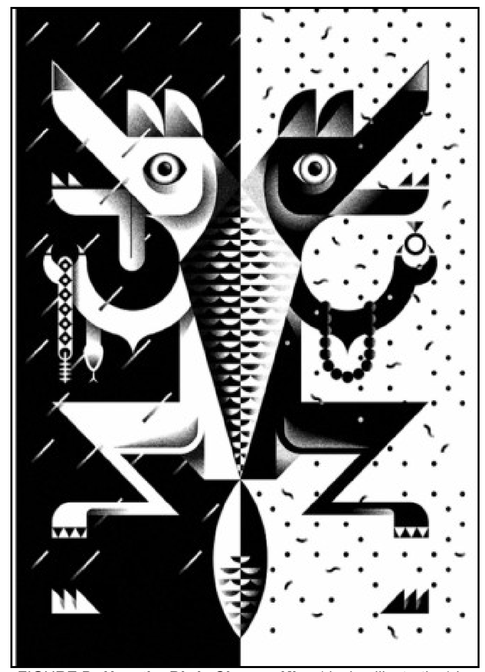
FIGURE B: How the Birds Chose a King (design illustration) by Jono Garrett (Johannesburg), 2015.