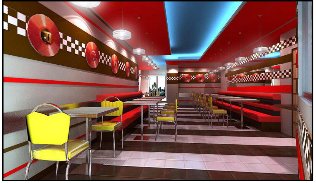
FIGURE E: Proposed restaurant by Kylie Shamini (Turkey), 2016.

In an essay (at least ONE page) compare the interior design of FIGURE D with that of FIGURE E above.