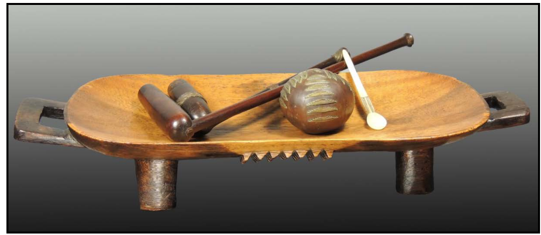
FIGURE K: Traditional Nguni products (South Africa), 1985.