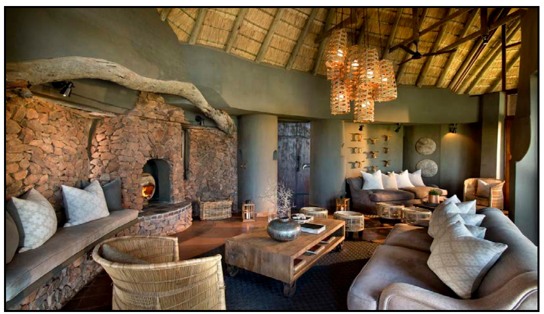
FIGURE D: Madikwe Safari Lodge (Kruger National Park, South Africa), 2011.