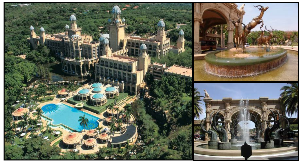
FIGURE G: Palace of the Lost City by WATG (Rustenburg, South Africa), 1990–1992.

Write an essay (at least ONE page) in which you compare the Classical building in FIGURE F with the contemporary building in FIGURE G. Alternatively, you may compare any Classical building with any contemporary building that you have studied.