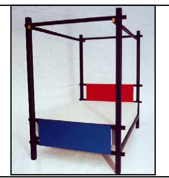
FIGURE I: De Stijl influenced bed.

Write a short essay (at least ONE page) in which you compare the bed in FIGURE H with the bed FIGURE I by explaining how they represent Renaissance and De Stijl respectively.