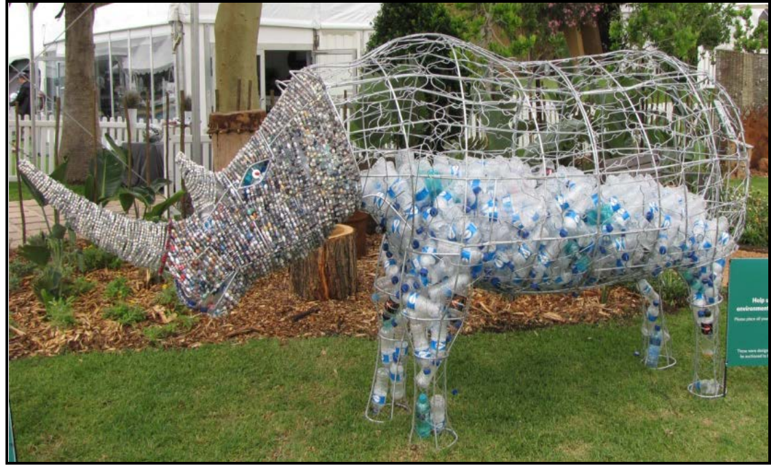
FIGURE A: Rhino by local crafters using wire coat hangers/beads/ plastic bottles (Pilanesberg, South Africa), 2012.