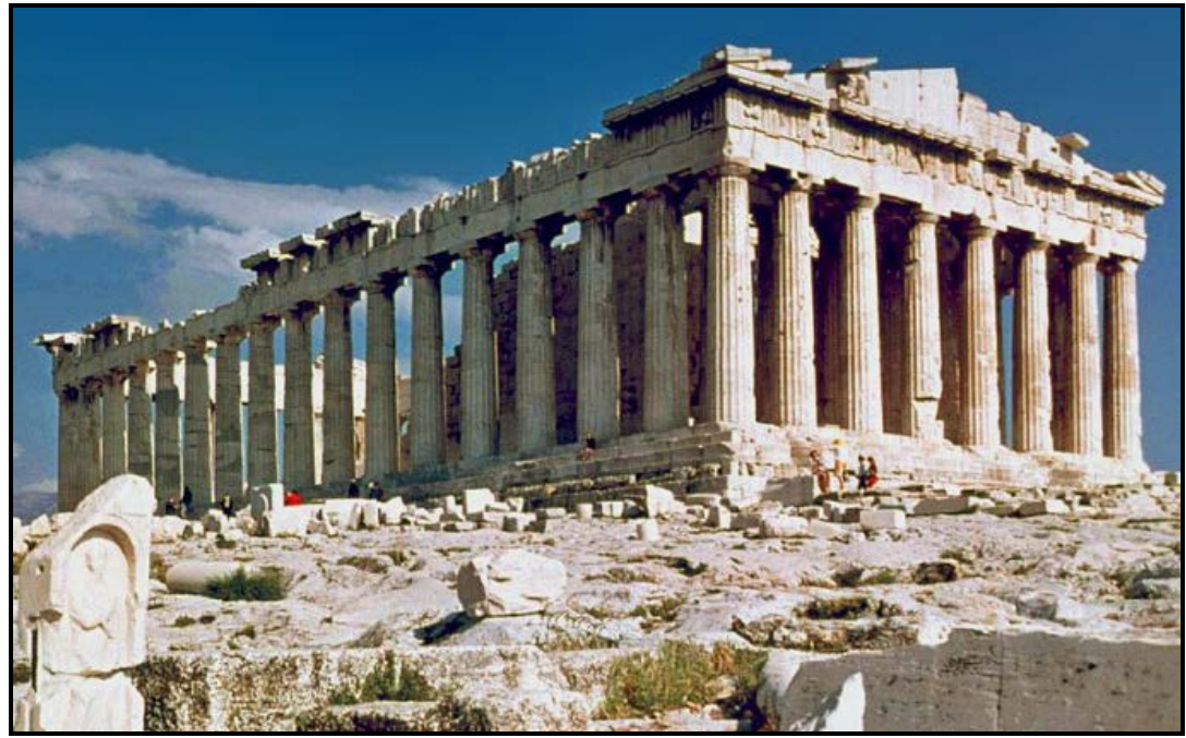
FIGURE A: The Parthenon (Athens, Greece), c. 432 BCE.

Write an essay (of at least ONE full page) in which you compare the classical building in FIGURE A above – or any other classical building that you have studied – with any contemporary building that you have studied.