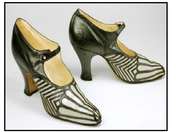
FIGURE A: Starburst shoe by T de Bont, Art Deco (Netherlands), 1922.