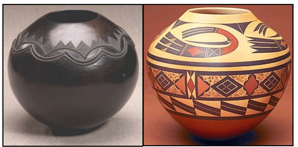
FIGURE A: Ukamba by Nesta Nala, (Thukela Valley, KZN, South Africa), 1994.

3.1 Refer to FIGURE A and FIGURE B below and answer the questions that follow.