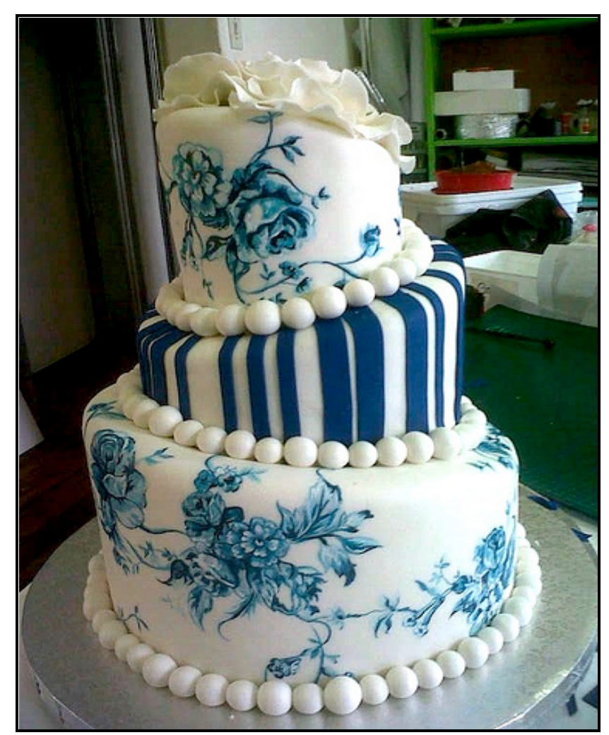
FIGURE A: Wedding cake by Charly's Bakery (Cape Town), 2012.