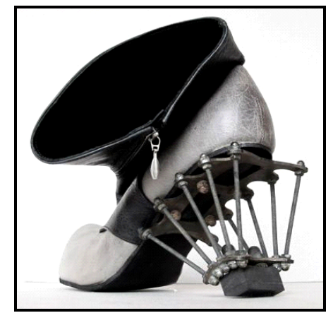
FIGURE B: Shoe by Kei Kagami, Japanese London based, Deconstruction (Britain), 2012.