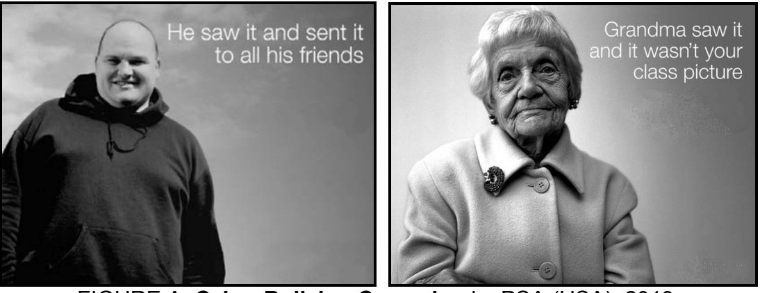
FIGURE A: Cyber Bullying Campaign by PSA (USA), 2013.

The misuse of personal images through various media platforms shown in the campaign above highlights that 48% of semi-nude and nude photographs sent by 13–17-year-olds through cellphone text messages have ended up in the hands of the wrong person.