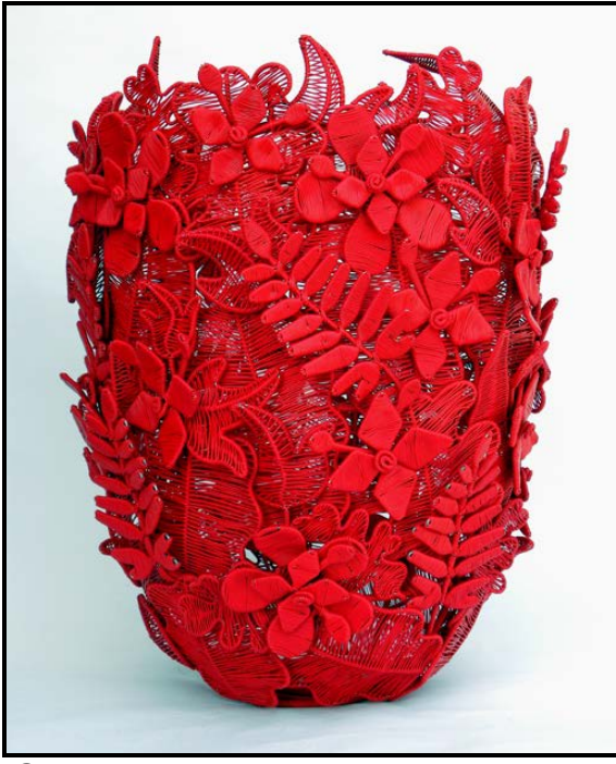
FIGURE A: Zenzulu Wire Nature Red Vessel by Marisa Fick-Jordaan (South Africa), 2010.

The designer of the vessel shown in FIGURE A above uses traditional craft techniques/ materials in a modern way and at the same time empowers individuals or communities. Write an essay (of at least ONE full page) on any ONE contemporary South African designer/design group.