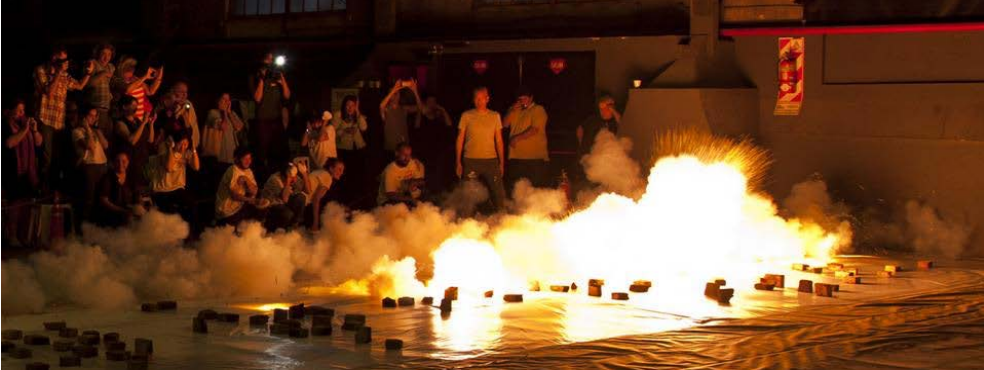
The above image details Cai Guo-Qiang's work being ignited.*