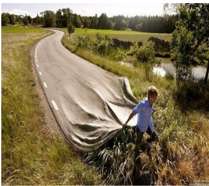
Erik Johansson, Go Your Own Road, Digital photography, 2011