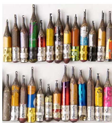
Dalton Ghetti, The Alphabet , carved from 26 pencil tips, 2011