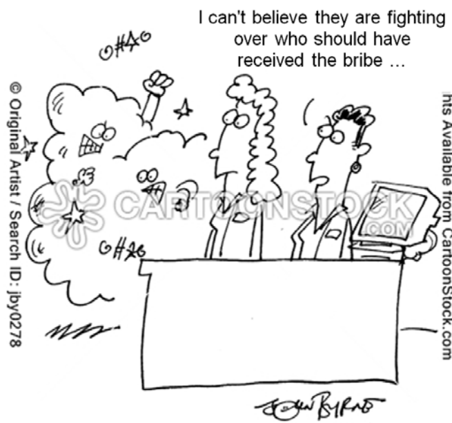
[Downloaded and adapted from < http://www.cartoonstock.com/directory/c/conflict_in_the_workplace.asp > on 22 November 2013]